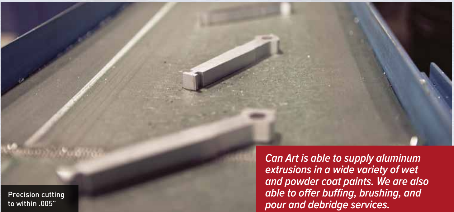
Precision cutting to within .005"

From small fabricated parts under 1" in length, to long product that can be up to 35', Can Art is a one stop shop for all your aluminum extrusion fabrication needs.